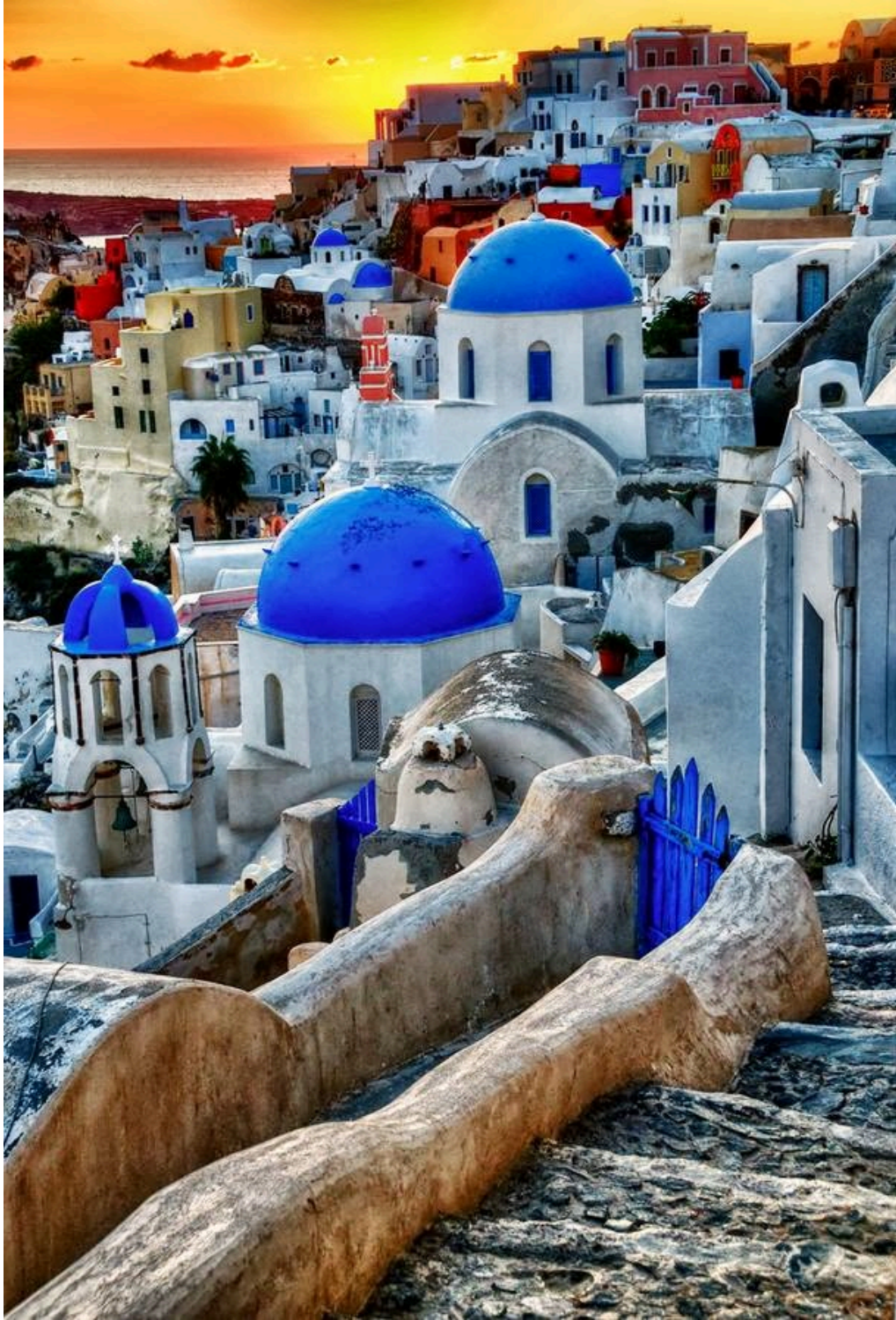
Oia, Santorini island, Greece