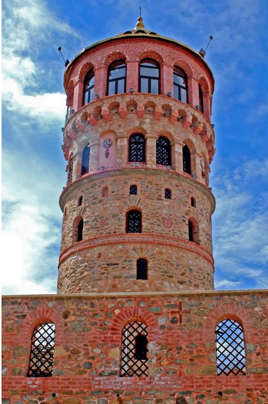
The tower of St. Minas, Emporio Kozani, Kozani, Macedonia, Greece