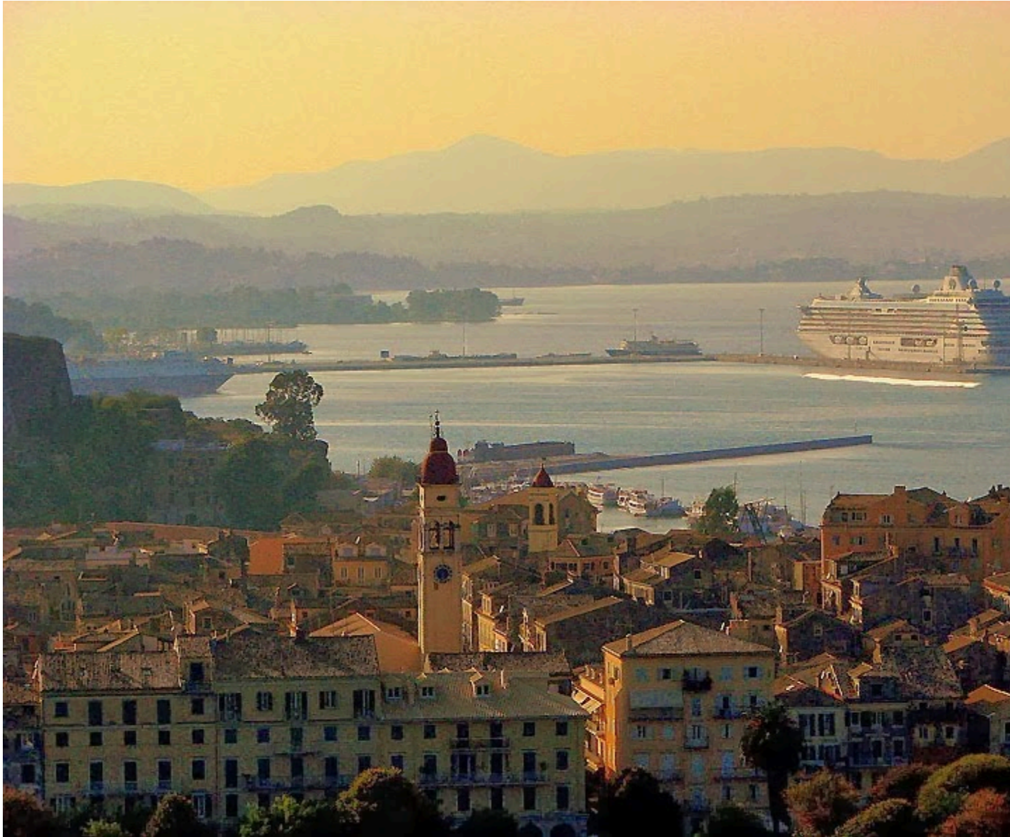
Corfu town, Corfu island, Greece