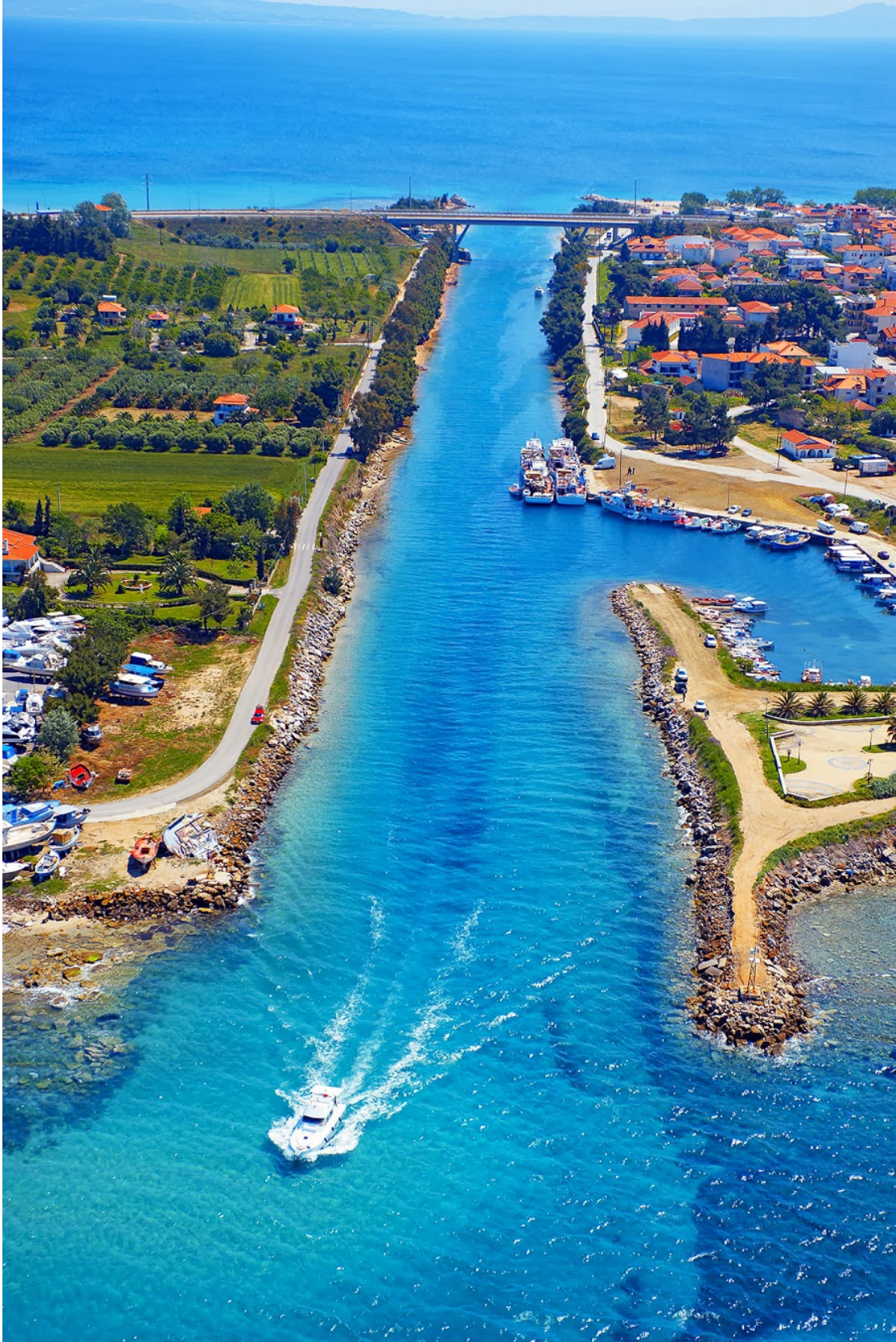
Potidea, Halkidiki, Macedonia, Greece