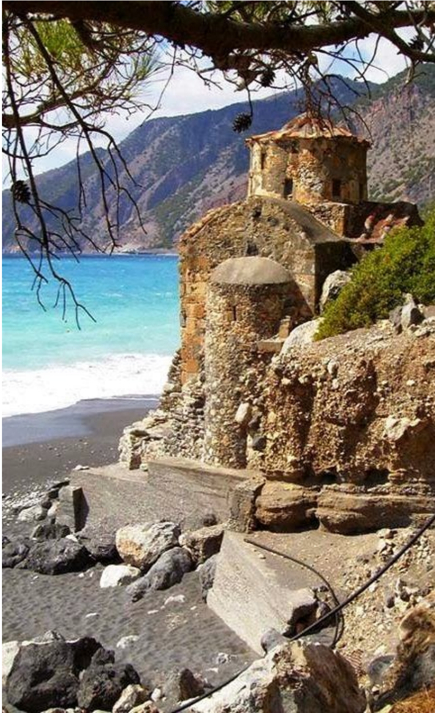
The Chapel of Saint Paul (11th century), Agia Roumeli, Crete Island, Greece