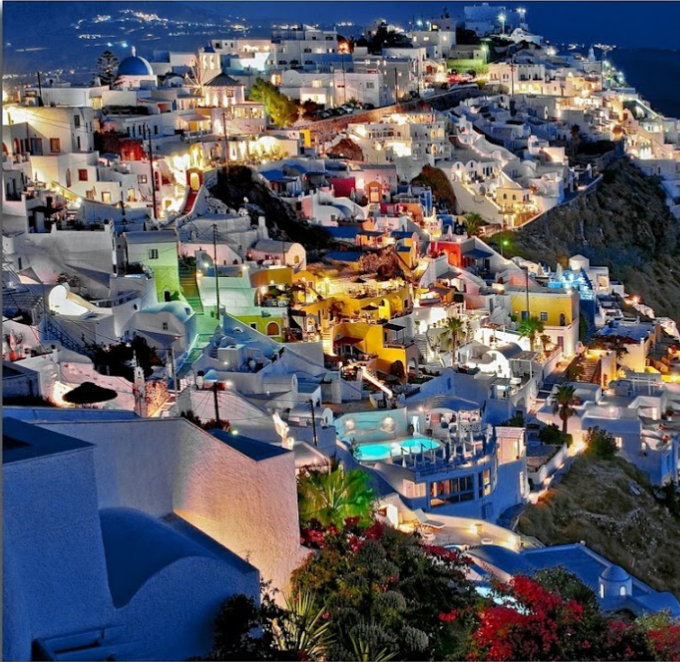
Santorini island at night, Greece