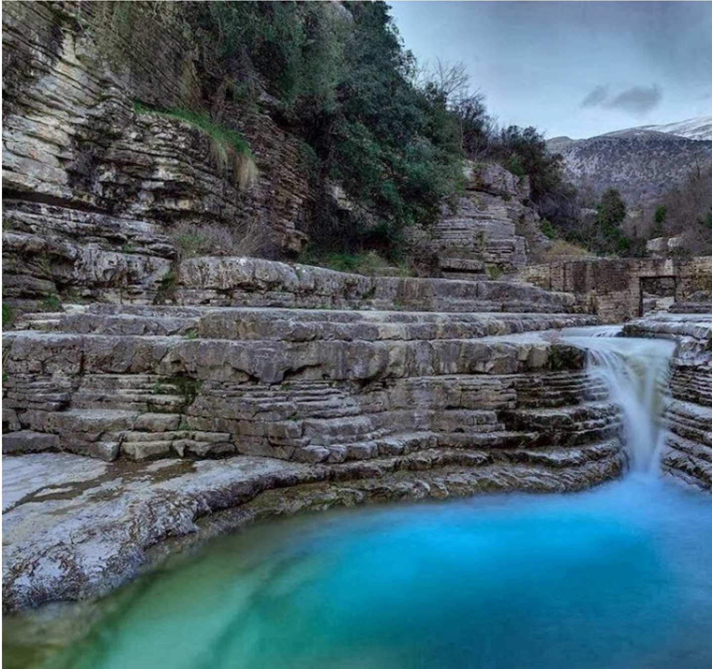
Amazing Landscape in Zagorohoria, Epirus, Greece