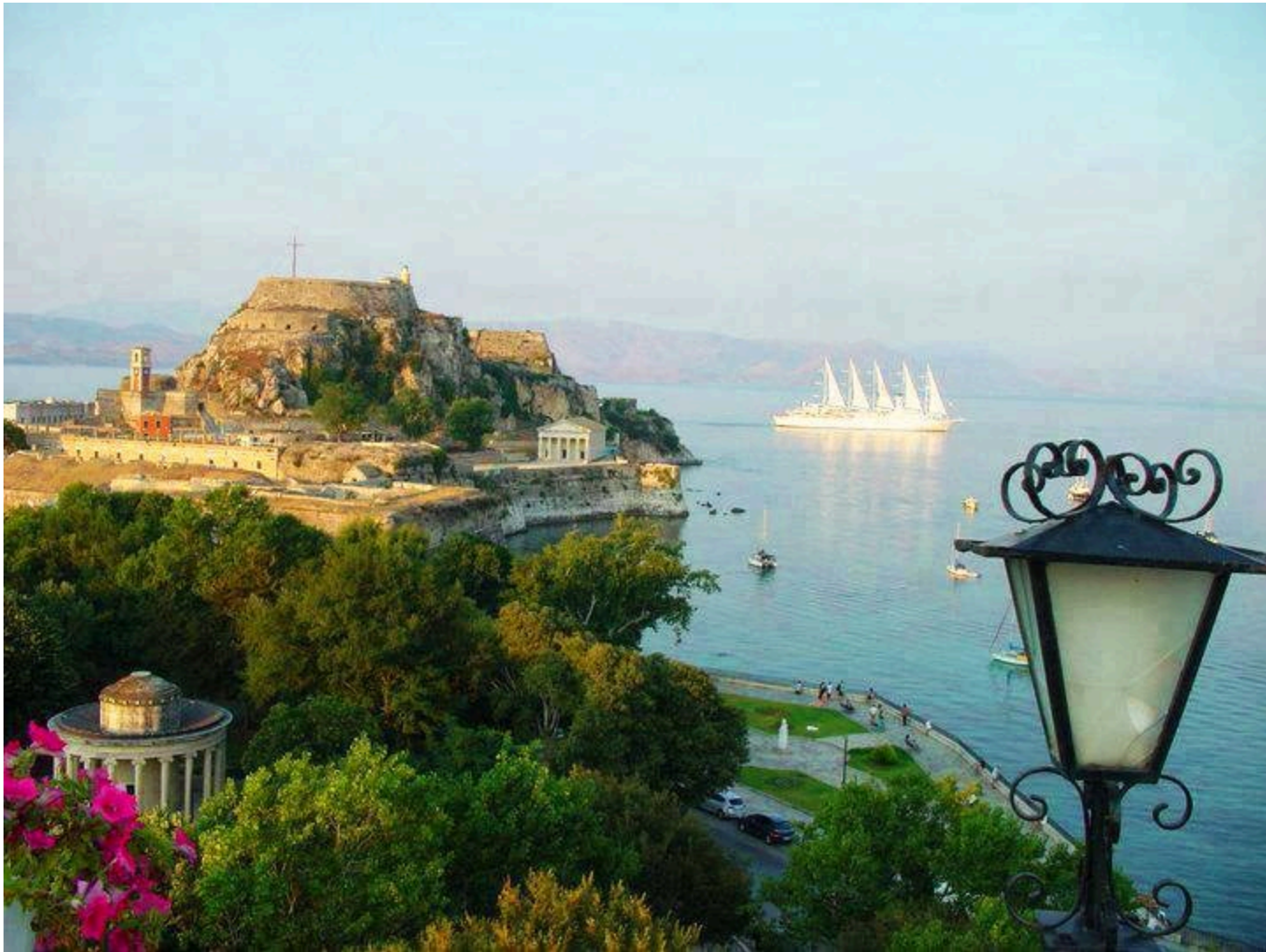
The soft morning light of Corfu island, Greece