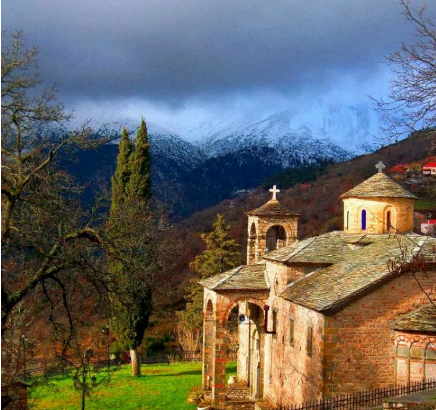
Old Stone Church in Petrilo, Karditsa, Thessaly , Greece