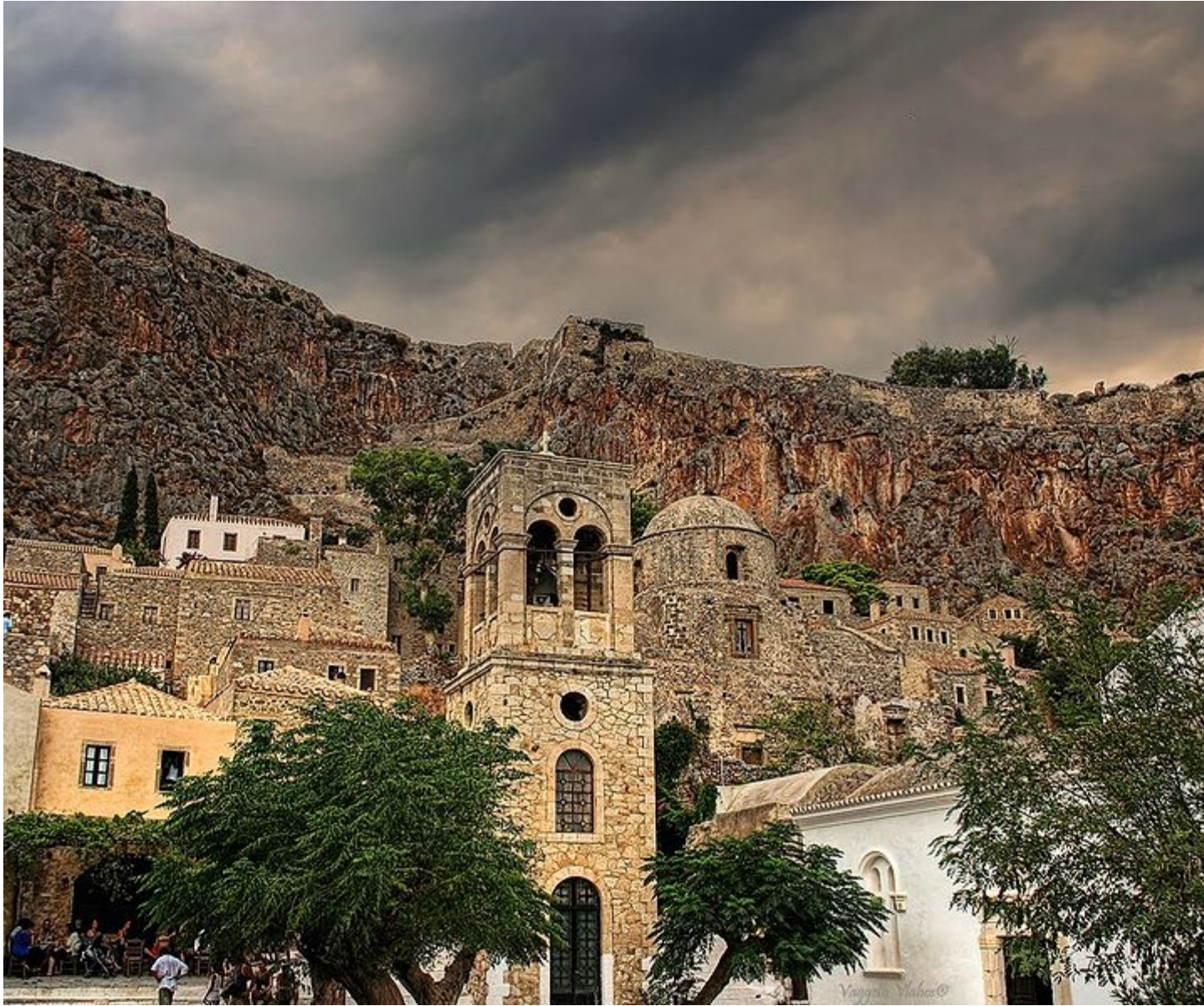
Medieval town of Monemvasia, Greece