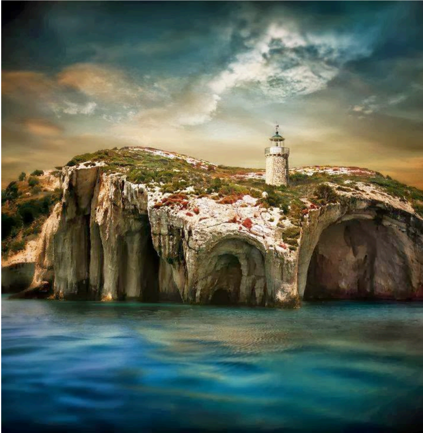
Caves and a lighthouse at Zakynthos Island, Greece