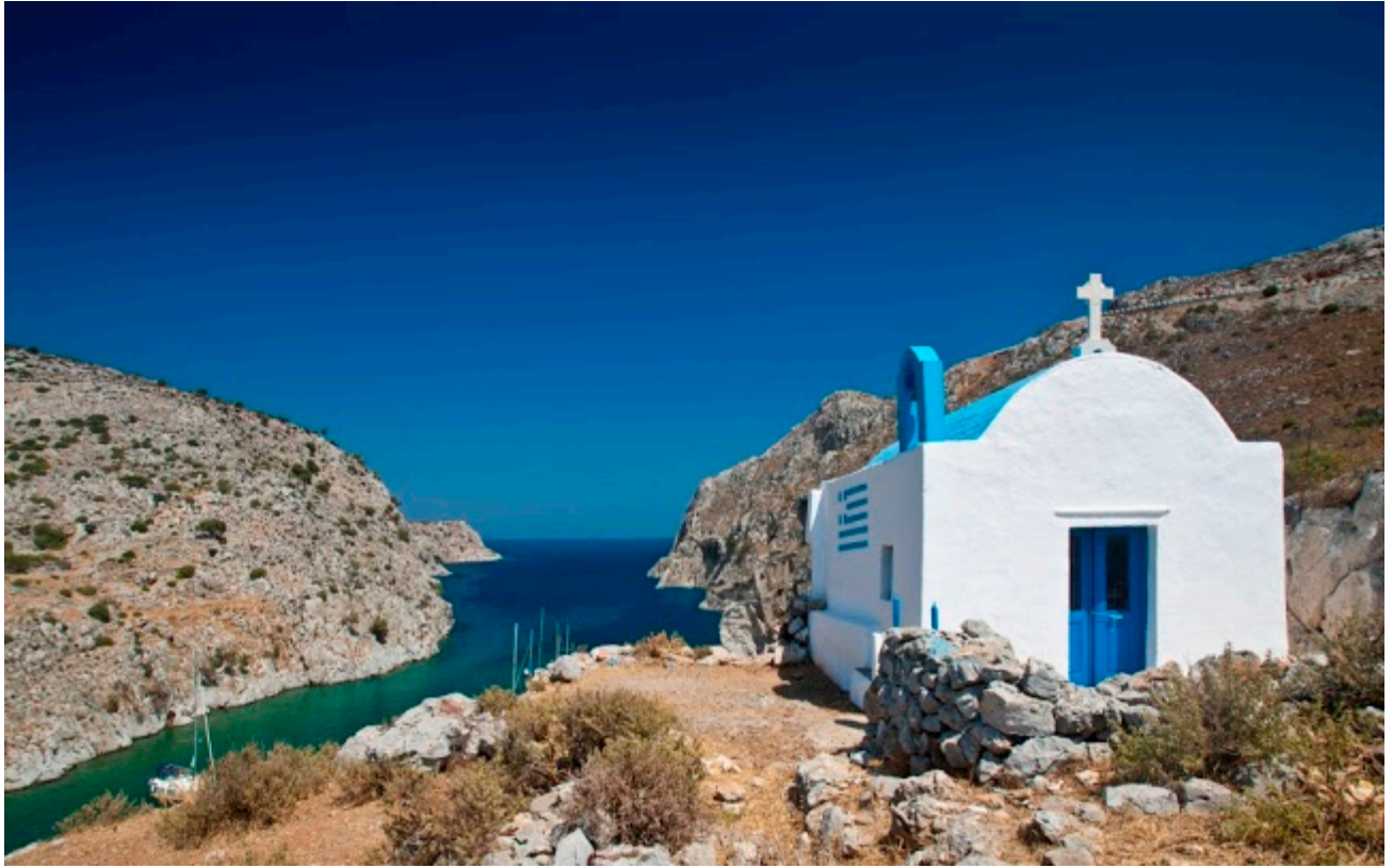
Small chapel on Kalymnos island, Greece