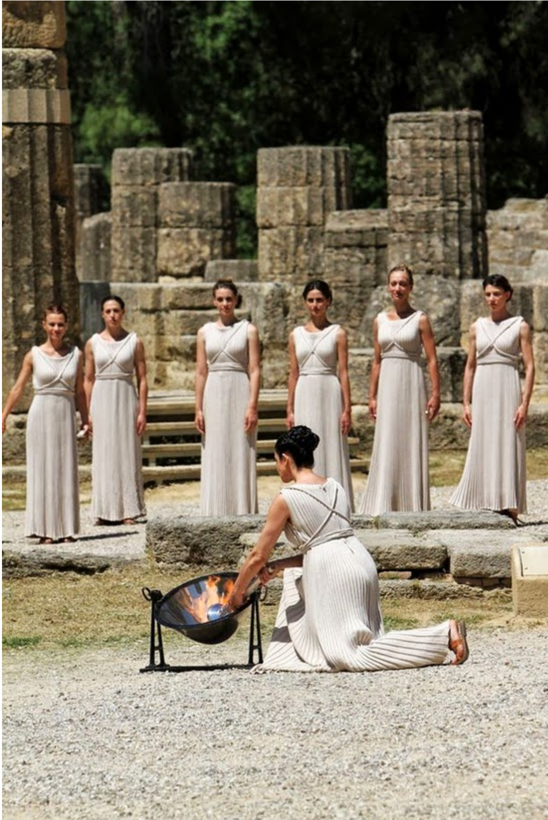
Olympic Flame ceremony, Greece