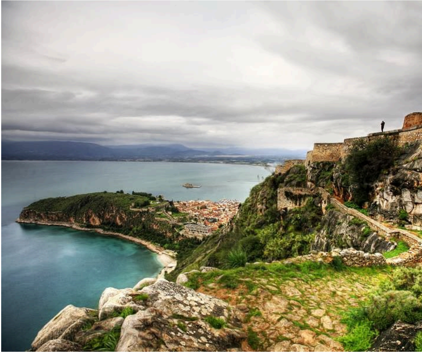
Palamidi, Nafplio, Greece