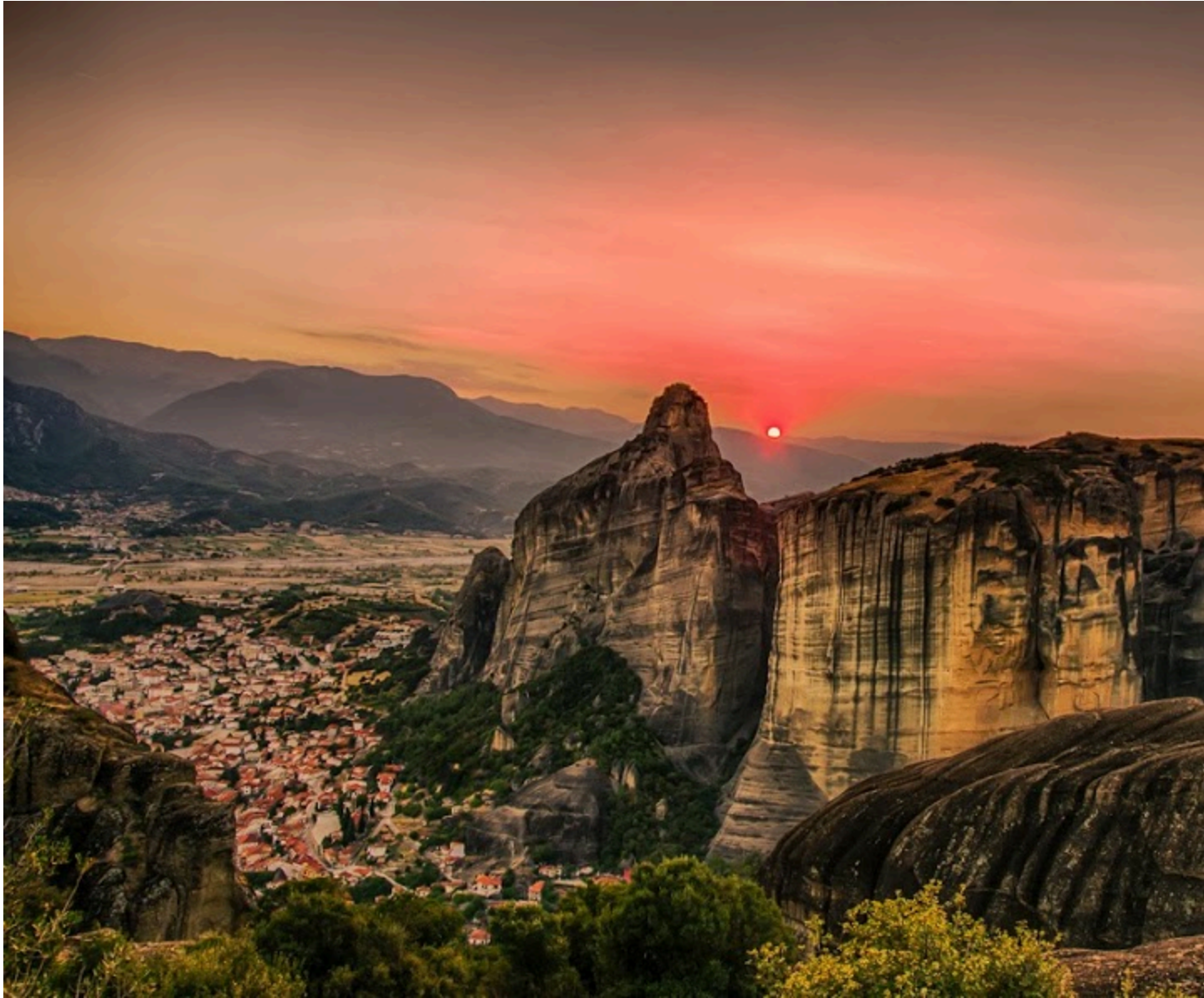
Sunset at Meteora, Thessaly, Greece