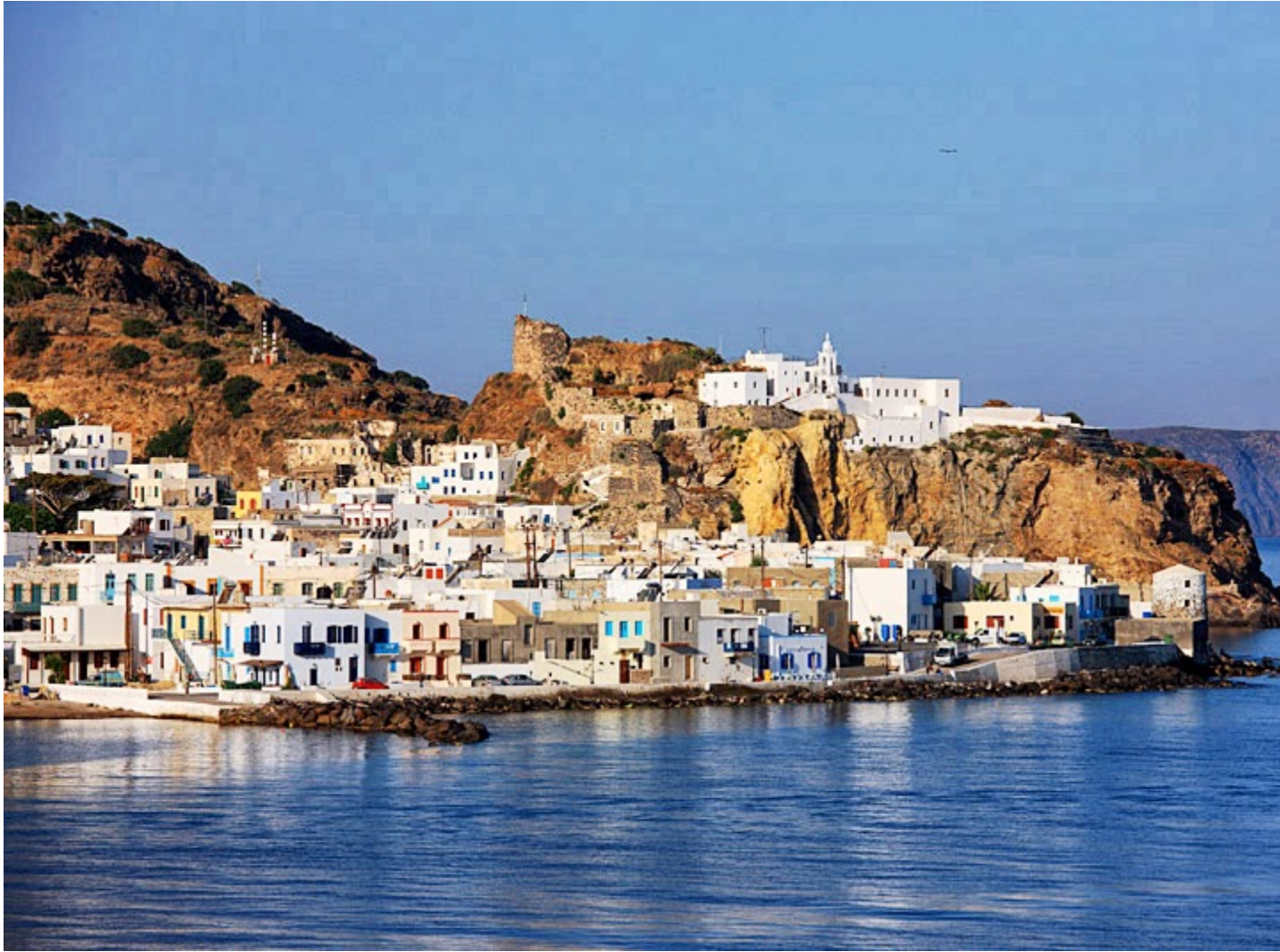
Mandraki, the "Chora" (= "capital") of Nisyros volcanic island, Dodecanese, Greece. Overlooking the village, you can see the Venetian fortress of the Knights of St. John (14th century) and the beautiful monastery of Panagia Spiliani (The Virgin Mary of the Caves), dating to 1600.