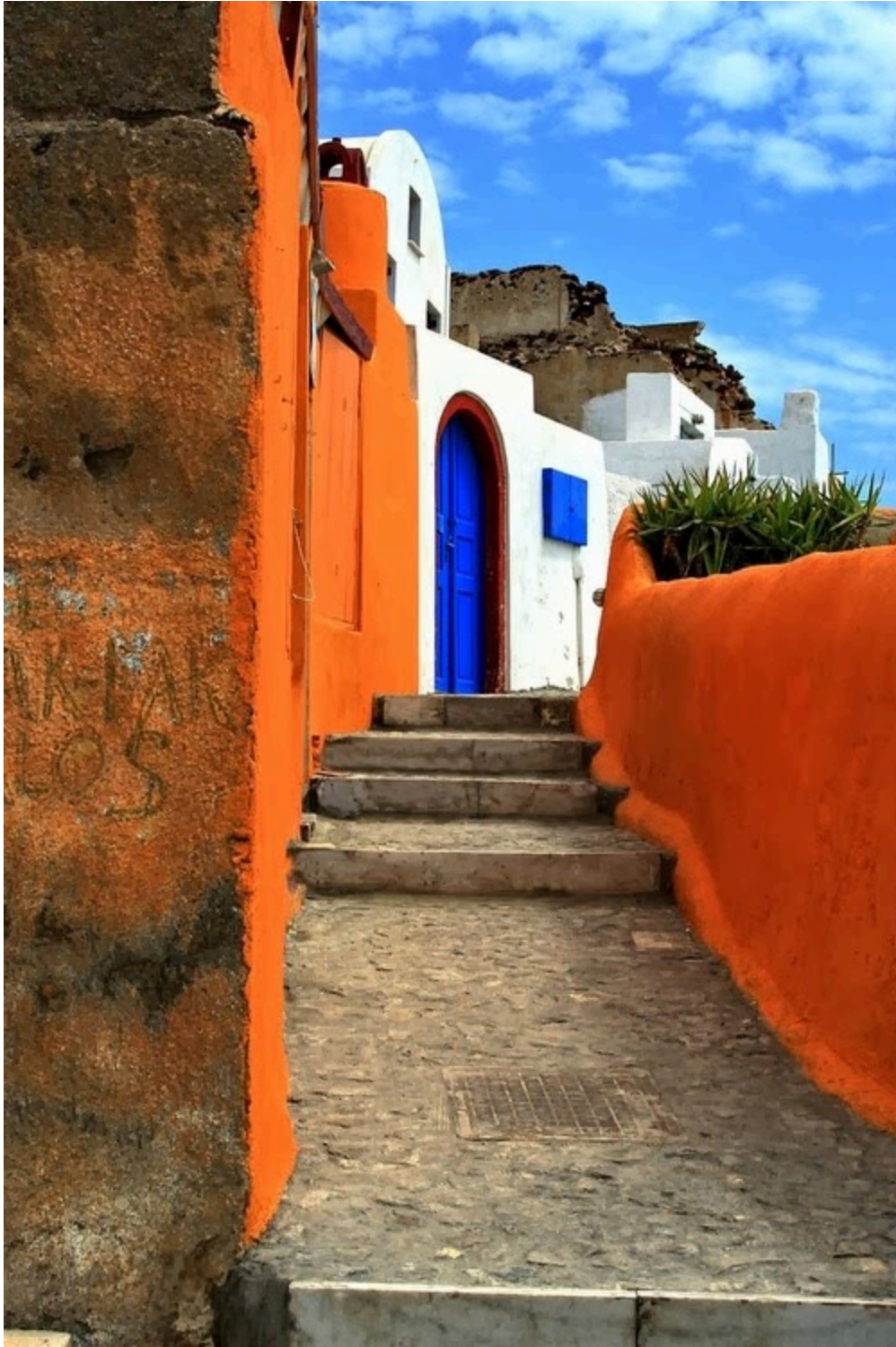
Path to Oia's Castle, Santorini Island, Greece