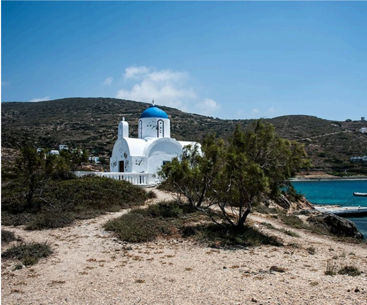
Katapola, Amorgos island, Greece