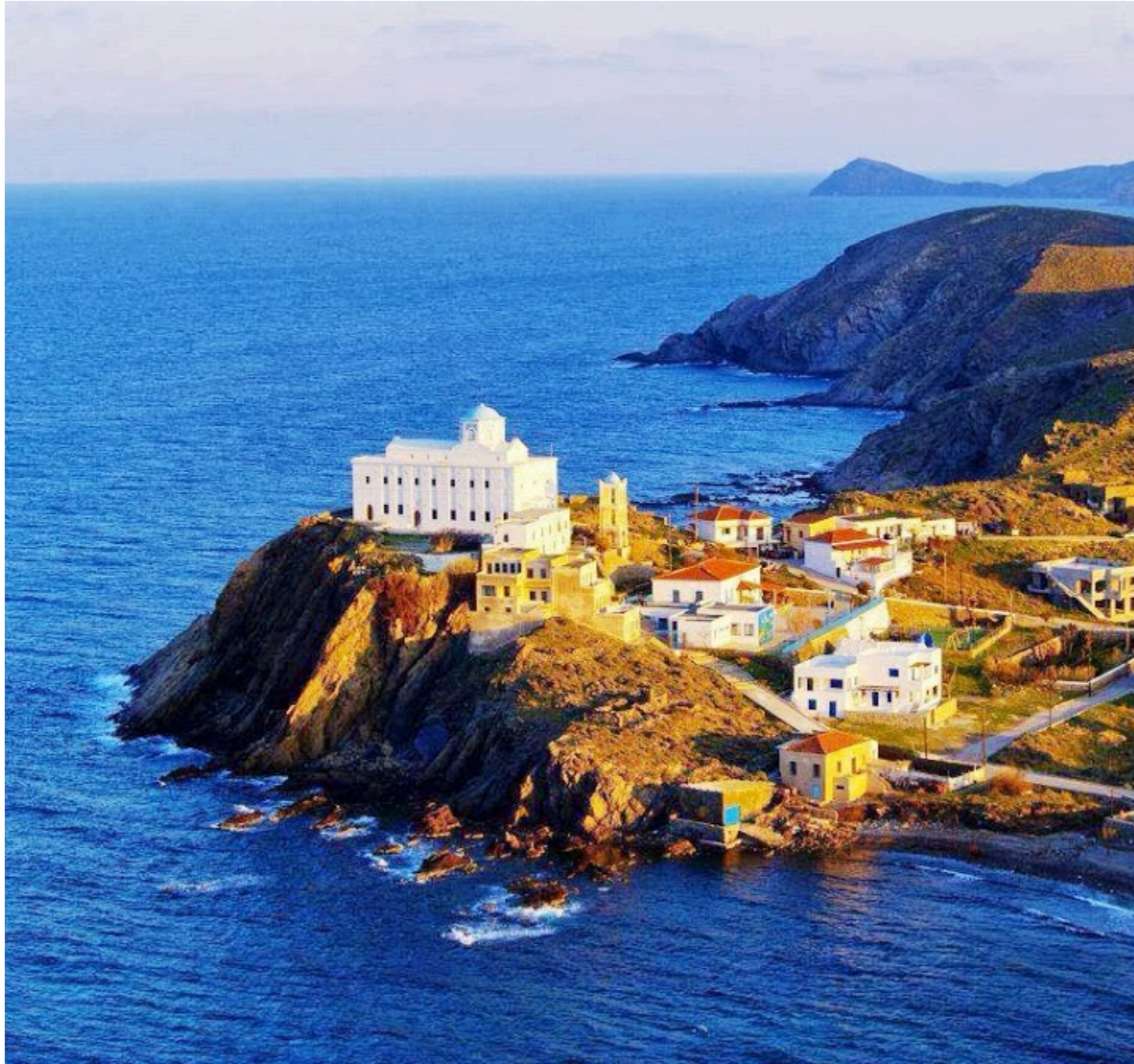
Psara island, Greece - Ψαρά