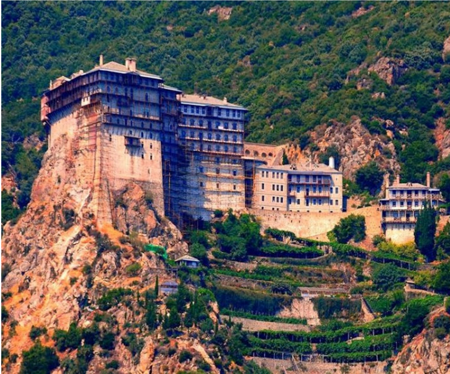
Simonopetra Monastery, mount Athos, Macedonia, Greece