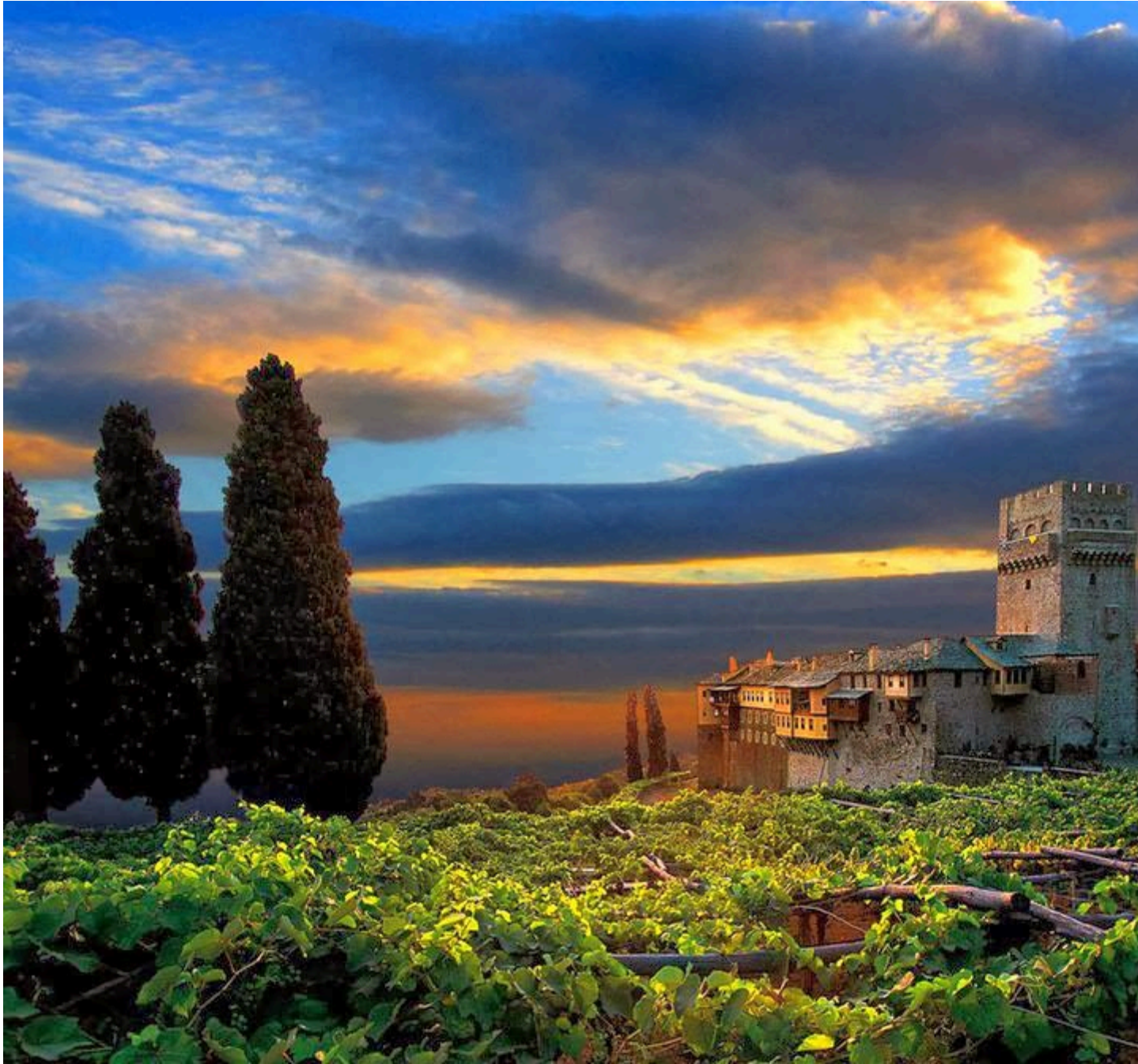
Monastery at Mount Athos, Greece.