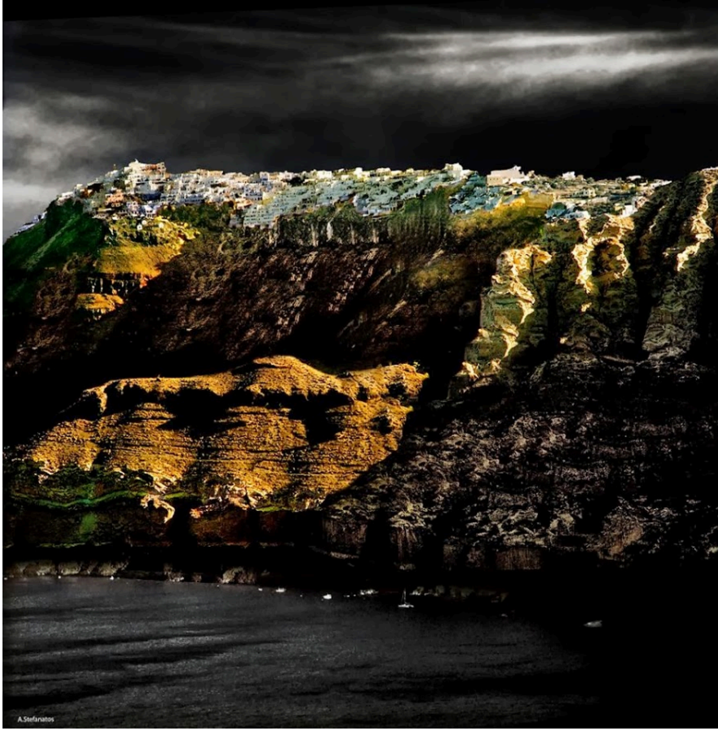
The wild beauty of winter in Santorini island, Greece